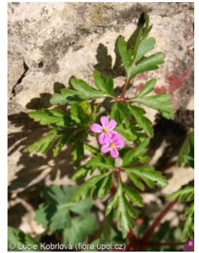
© Dušan Koblíř (flora upol. cz)